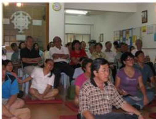
At Mudita Buddhist Society, Klang