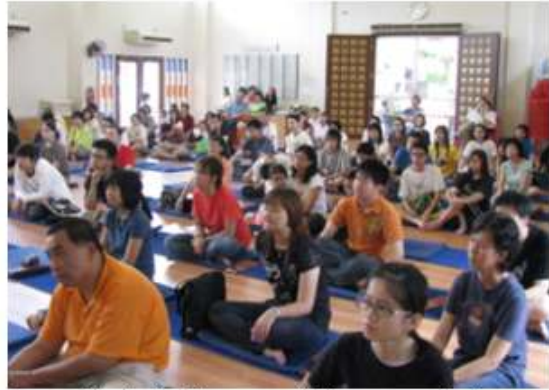
Sharing the Dhamma with the young and old