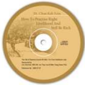
My first Dhamma Audio CD