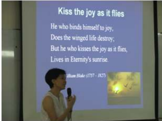
Speaking to Catholics on Buddhism

Sharing the Dhamma has brought a new meaning into my life. At the end of every talk, I feel a sense of achievement and reward of having done my small bit in propagating the Buddha's sublime teachings to others. And I hope that in doing so, I have managed to plant a Bodhi (awakening) seed in the hearts and minds of my audience so that they would put the Dhamma into practice and realise the joy themselves.