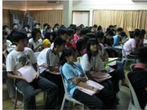
Youth Camp at Buddhist Maha Vihara.

Sharing the Dhamma also brings me the joy of cultivating the Four Brahmaviharas of metta , karuna , mudita and upekkha . Metta (loving-kindness) to all beings who would benefit from our talks. Karuna to the devotees who trust us enough to share their problems. Mudita , when we share the success and happiness of others, and when others rejoice with us. And Upekkha when things get tough, and the tough must rise up and remain standing. Upekkha is also called upon when everything is running smoothly because we must remember that all conditioned things are impermanent, and change is the only truth in our samsaric existence.