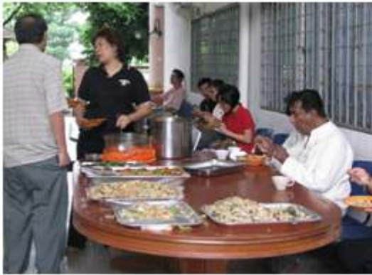
Food, Glorious Food!

The graduation of the UMDF's 1 st Dhamma Speakers Course was to be held in January 2008. After two long years, fourteen of us who had fulfilled the minimum requirements would be allowed to graduate. We planned eagerly for the ceremony. We would have an organic vegetarian dinner – as our gift to our coordinators, our mentors and all our supporters from the various Buddhist societies. They had given us something priceless – their time, energy, love and commitment. We would never be able to give them anything else to reciprocate their priceless gift to us. Since the Buddha said that “Health