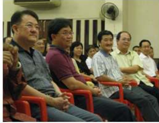
Our mentors and friends.