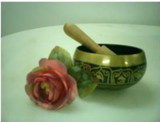
My singing bowl.