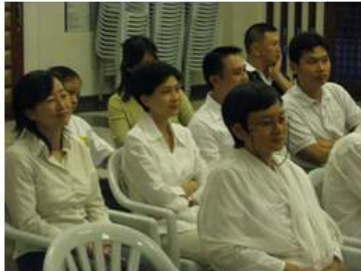
All of us dressed in white, in the spirit of camaraderie.