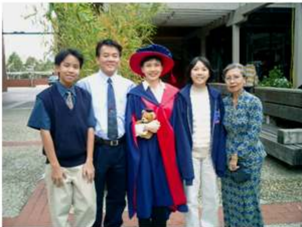
My family with me at my Ph.D. graduation, October 2004.

It was very hard at the beginning. As a mother of two relatively young children, my life was already packed to the brim with household chores and responsibilities. I would go to work in the morning, rush back with lunch for one child, then take him to school and fetch the other back from school. Then, it was often the endless rounds of ferrying them to and fro until late at night. This was of course thanks to the ubiquitous tuition classes, a malady that has afflicted modern-day society due to sad and uncontrollable circumstances (and this issue can be a topic for another book which I shall certainly not attempt to write!). Besides being an unpaid chauffeur, I also had to run errands, clean the house, cook – well, pretty much everything that a modern-day working mother has to do. I had no domestic helper too.