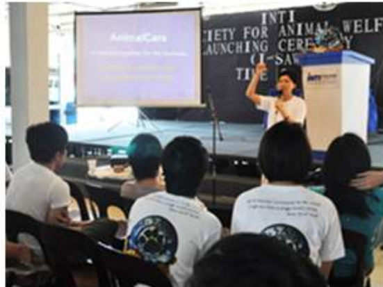
Speaking to students about kindness to animals