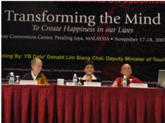
Can you see me shivering?