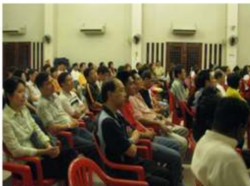
Kalyanamittas who came to rejoice with us.

The DSC started with a bang, and we all hoped it ended with a bang too. As I said in my address to the audience that evening, this graduation marked the beginning, not the end. Now comes the hard part where we would have to go out, be on our own, and spend the rest of our lives fulfilling our pledge of sharing the beautiful Buddha- Dhamma with others.