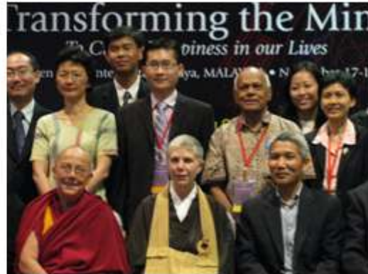
One for the album. An experience of a lifetime.

The 5 th global conference was a resounding success in every way. Everyone came away with a great sense of having learnt something new, and being inspired to put the sublime teachings into real-life practice. I was very thankful to be a part of this event. I count this as another memorable milestone in my life.