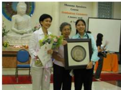
One for the family album - my mother, my daughter and me.