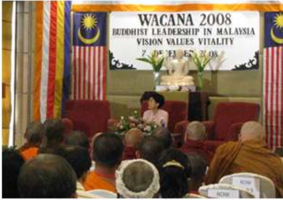
Moderating a session at Wacana 2008

In the words of William Shakespeare, “To thine own self be true, and it must follow, as the night the day, thou canst not then be false to any man.” Dhamma speaking has heightened the need for a higher level of honesty and sincerity in my own speech, thought and action. I am very thankful for that. From my short experience, I only have this one thing to say – Sharing the Dhamma ...is priceless.