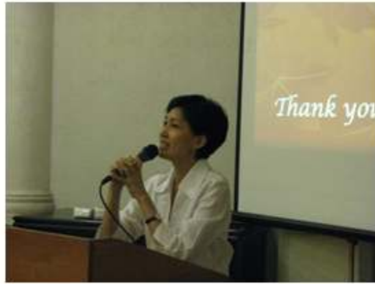
Thank you, everyone.....

As I now begin on my journey as a Dhamma speaker, I remind myself of the Buddha's words, Yo Dhammam desesi. Adikalyanam, Majjhekalyanam, Pariyosanakalyanam . I am thankful that I have been given this beautiful opportunity to continue turning the wheel of the Dhamma , as others have before me.