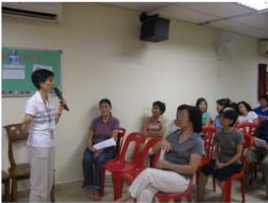
At "home", in Ti-Ratana, Klang, where is there an endless flow of love and warmth.