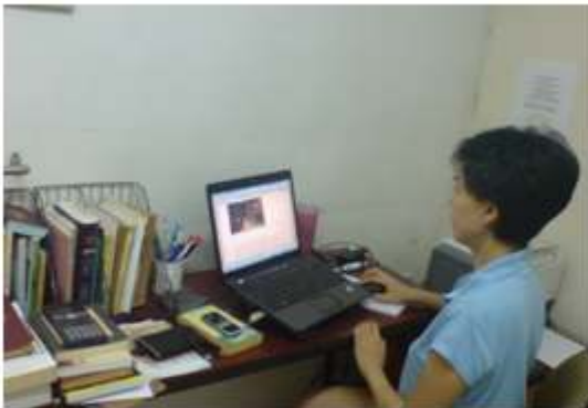
Researching late into the night AND hounding mentors with questions, through the email.