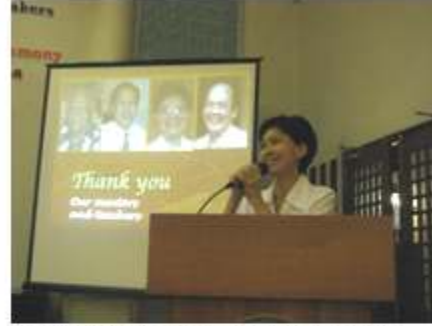
We thank you from our hearts, dearest mentors