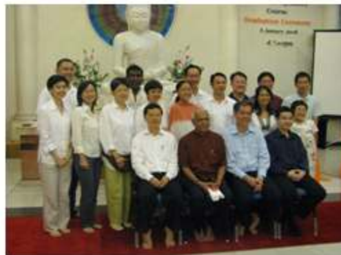
Going forth...to spread the Dhamma far and wide!