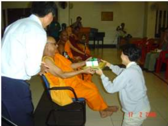
Receiving my books from Chief. Notice the two layers of clothing?

So I wrapped myself in two layers of clothing and armed with a small towel (in case I needed to sponge myself if my fever ran too high), I drove to SJBA that evening. I registered, made my way into the hall, found a chair amongst the participants' seats and slumped onto it. Luckily I did not faint – my fever was at its all time high. Wrapped up in thick layers of clothing, I could have easily passed off as an Eskimo girl that night.