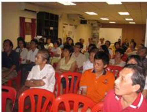
At Ti-Ratana Community Centre, Klang

Sharing the Dhamma also brings me the joy of cultivating the Four Brahmaviharas of metta , karuna , mudita and upekkha . Metta (loving-kindness) to all beings who would benefit from our talks. Karuna to the devotees who trust us enough to share their problems. Mudita , when we share the success and happiness of others, and when others rejoice with us. And Upekkha when things get tough, and the tough must rise up and remain standing. Upekkha is also called upon when everything is running smoothly because we must remember that all conditioned things are impermanent, and change is the only truth in our samsaric existence.