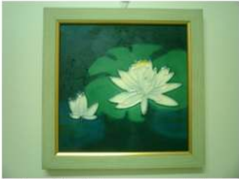
The painting that hangs on my wall. A reminder...to be like the lotus.

how much it means to me to be able to finally do some Dhammaduta work after having spent the last two decades devoting all my time to the home and the family.