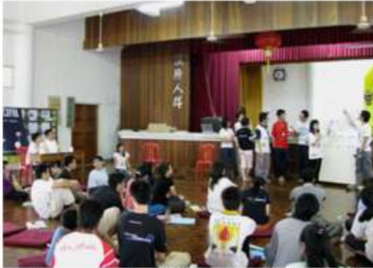
Youth Camp at Klang & Coast Buddhist Association.

While it takes a lot of effort, perseverance and commitment to become a Dhamma speaker, the joys and rewards are tremendous. Not only have I learnt so much more in my own knowledge and experience of practising the Dhamma , I also find myself practising certain aspects of the Ten Paramis such as viriya (effort), sacca (honesty) and aditthana (determination).